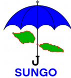
Samoa Umbrella for Non-governmental Organisations (SUNGO)

SUNGO has been in operation since 1997 and holds a pivotal position in Samoan civil society because it is both an umbrella for approximately 250 member organisations, while also implementing projects in its own right. In its umbrella role, SUNGO has a particularly strong understanding of the challenges facing CSOs in Samoa and provides training, information, advocacy and research to support community organisations. The organisation has built a reputation as a voice for voiceless in relation to issues affecting vulnerable groups such as women, children, people with disabilities and victims of violence. The organisation has worked hard to develop constructive relations with government agencies and is represented on several ministerial Steering Committees