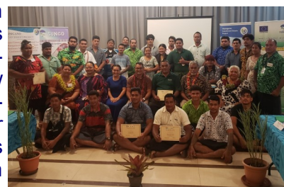
MNRE CashForWork Recruits

- In partnership with MNRE, SUNGO has developed and recently delivered a new course in basic communications skills for cash for work recruits engaged by MNRE on village forestry projects. Thirty people