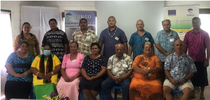
SUNGO Executive Council, Management & Staff 2022

17th & 18th June 2022, SUNGO Headquarters, Vaitele - SUNGO Executive Council Members and SUNGO Staff recently attended a two day retreat at the SUNGO office with the main objective of familiarizing everyone with SUNGO's Policies and Procedures, the SUNGO Constitution, and the SUNGO Strategic Plan. This was also an opportunity for the incoming new Council and staff to get to know one another through meeting sessions and over shared meals.