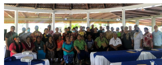
SUNGO Members' Meeting on the Electoral Act 2020

24th June 2022, Tiafau Fale, Millenia Hotel, SOGI - Samoa's Commission of Inquiry has been established to inquire into Electoral Matters 2021. In June, SUNGO held a meeting to seek feedback from its civil society members about the Electoral Act 2019 which was controversially passed by Parliament without proper consultation. The Act contains multiple clauses viewed as violating the human rights of Samoa citizens. Most participants agreed to the changes currently in discussion through consultations within the communities. Attached is a link to the Commission of Inquiry portal. https://coi.oec.gov.ws/