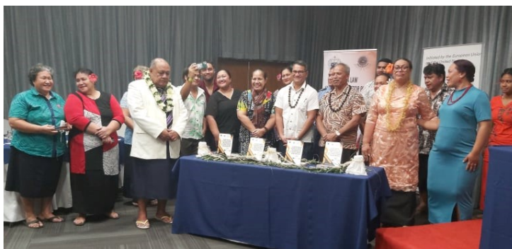
Law & Justice Sector & Stakeholders Launch