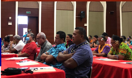
SUNGO Members' Meeting on Thematic Areas