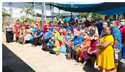
SUNGO Annual General Meeting 2020 - 2021 Group Photo #2