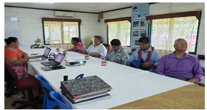
Paueta Club - Satitoa Members seeking assistance for the CFLI Concept Note