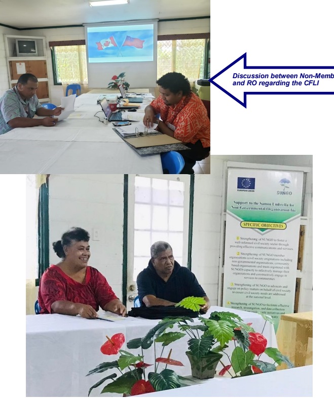
EFKS Togo, Saleimoa Members