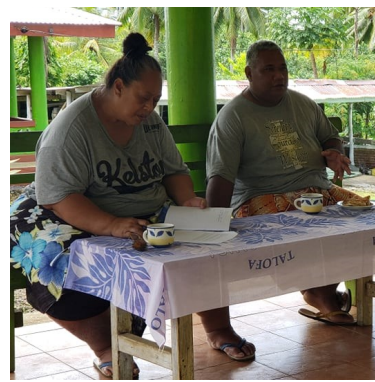
Mauloa Development Members

These activities were Funded by the European Union.