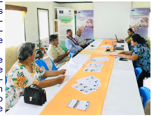
Paueta Club - Satitoa Members & SUNGO ICO and PA

funding opportunity supports local developments especially within the communities. Members were grateful for the assistance provided. Non members who visited the