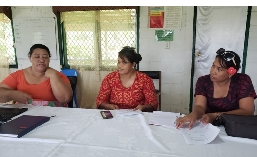
Seki Vibez Members receiving mentoring assistance on how SUNGO Operates, as well as knowing more about SUNGO's services to the Civil Society.

SUNGO values this 1-1 contact with as it gives SUNGO the opportunity to work more closely with communities and understand their needs.