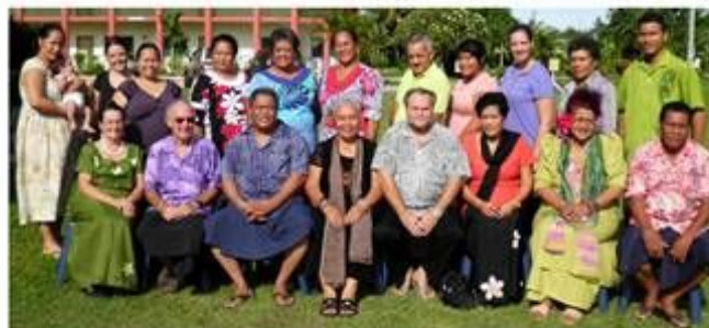
SUNGO Staff and Board at the Board Retreat in April at Tofamamao, Leauvaa.