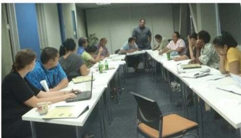
Proposal Writing course held in the Samoatel/Bluesky conference room. June 8, 2011, Malua Fou, Apia.