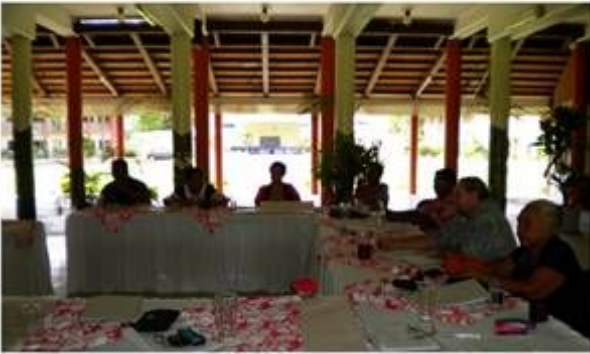
Board Members look at the expected financial report for the past fiscal year.