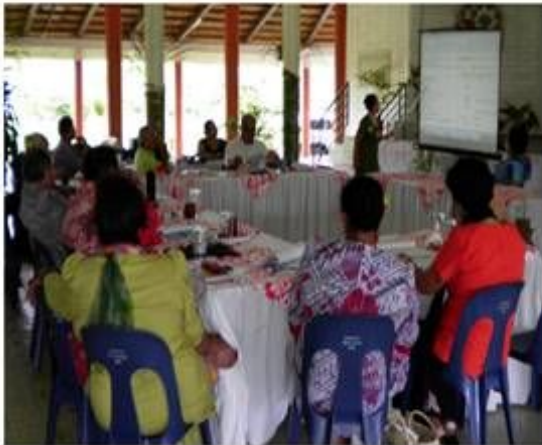
SUNGO Board retreat is an annual capacity building opportunity like the ones funded by the NZ Aid Core Funding that has helped SUNGO grow to more effectively deliver services to members .

E ono (6) Fa'alapotopotoga Tuma'oti (NGOs) na mafai ona fa'atinoina auaunaga anoa ona o le fesoasoani tau tupe i le tausaga mulimuli o le polokalame. O le Asosi o Galuega Taulima a le Tagiilima (THA) e galulue fa'atasi nisi o