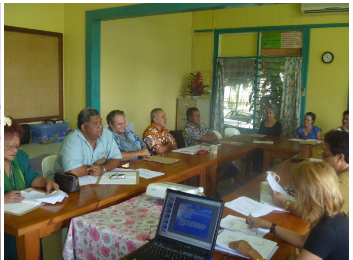
Board members discussing issues raised in the Advocacy Training.