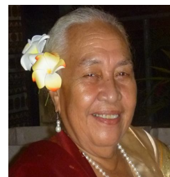
Message from the National President