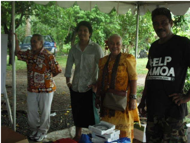
SUNGO President, staff and volunteers unpacking the Tsunami relief containers.

In total SUNGO helped to distribute seven containers of clothes, food and household items to the affected villages. The staff, board and volunteers worked tirelessly to get the aid to those in need as fast as possible.