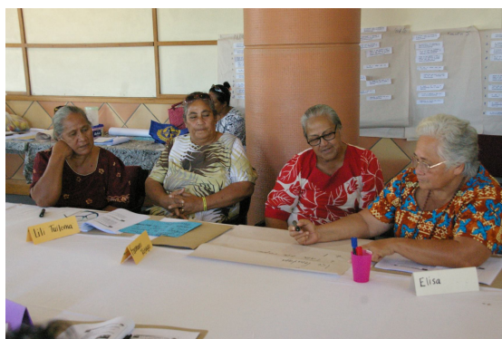
Members at Managing Organisations training.

The course was designed and taught in Samoan language with a respect for cultural aspects.