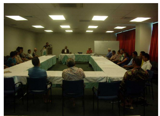
Basic Beekeeping workshop.