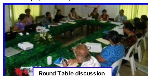
Round Table discussion

The Forum focused on the issues that matter most to young people; the questions gathered using a unique participatory process through collaboration between the Pacific regional Umbrella body (PIANGO) and SUNGO.