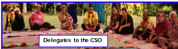
Delegates to the CSO

SUNGO welcomed to Samoa some very special guests last on Tuesday 3rd June during an Ava ceremony. Staged at the Vaitele Office, the ceremony kicked off a very important meeting not only for SUNGO but for some small Island states around the world which takes place at Moanalisa Hotel on the 4th—5th June.