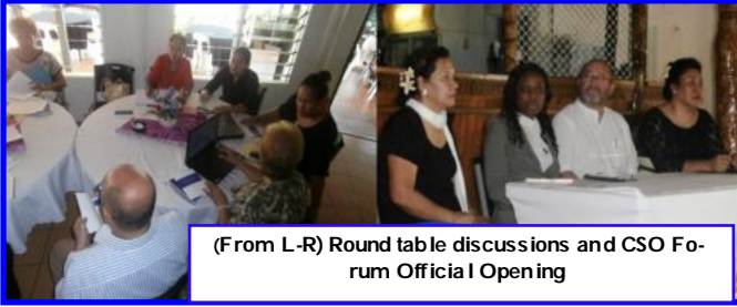
(From L-R) Round table discussions and CSO Forum Official Opening

O le Aso 3 o luni sa faataunuina ai ile Ofisa autu I Vaitele ale Faamalu le Ava ole Feiloaiga e faafeiloai atu ai ma malo/sui auai mai itulagi o AIMS, Caribbean faapea sui auai mai le Pasefika ile Fonotaga o Sosaiete o Tagata Lautele.