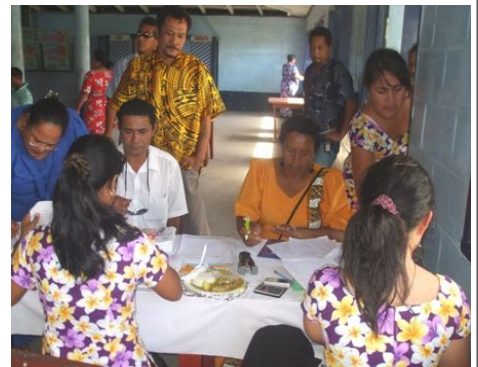
Aufaigaluega a le SUNGO i le taimi o le resitalaina o suafa o sui auai.