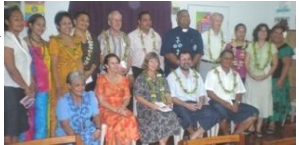
Participants at the MOA launching.

Six Brochures were launched by Mapusaga o Aiga (MOA). They were written in the Samoan language, 4 of which are Children's Rights Convention detailing the 4 different categories of the convention and the Sexual Abuse against children brochure. These five brochures are funded by the Save The Children NZ fund. The Domestic Violence brochure is funded by the Pacific Prevention for Domestic Violence Programme (PPDVP) that makes up the six. Partners of the organisation from government, NGOs and donors were present at the launching. Amongst the participants were Hon. Minister for MWCSD Hon Naomi Fiamē N Mataafa, Chief Justice Vui Clarence Nelson, NZ High Commissioner Caroline Bilkey, CEO for MWCSD Luagalau F.E.Shon and member organisations' representatives.