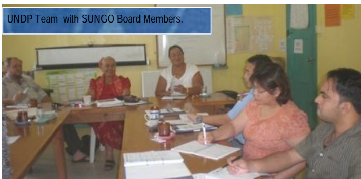
UNDP Team with SUNGO Board Members.

SUNGOs stakeholders, members and government ministries to gauge views on the current organisation operations and to identify gaps for improvement. The set up will include a National Implementation Team (NIT) of 3 staff and managed by a National Advisory Committee comprising members from all sectors to advise and determine any project outcomes that is best for Samoa. A report on the Mission findings will be tabled to validate the outcome of the capacity assessment.