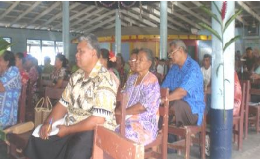
Sui auai i le taimi o le fonotaga.

O sui na auai mai i nuu ma alalafaga i le motu tele i Salafai e iai Komiti a tina, faapotopotoga o ekalesia eseese, alii ma faipule aemaise le aufaipisinisi. Na i'u ma le manuia le faamoemoe ua leva ona moemiti iai le Komiti Faatonu ma le Pulega a le SUNGO, ina ia nofo malamalama le mamalu o le atunuu e leai se silafia i mataupu o loo o latou aafia ai.