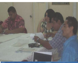
Participants at the PMU-EPC Consultation.