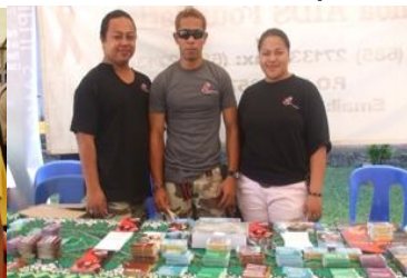
SAF Staff members at Open Day.