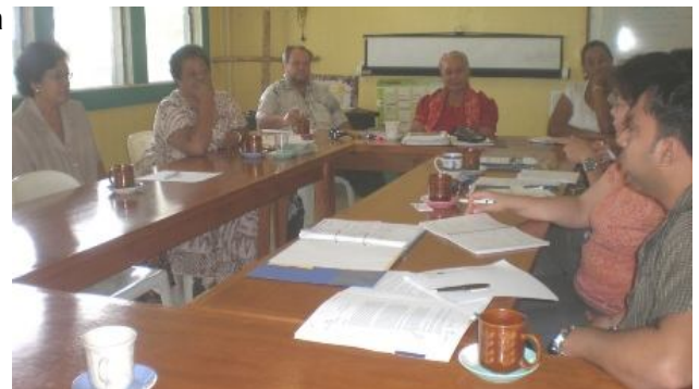
Fonotaga a le Komiti Faafoe SUNGO ma sui o le Malo Afaatasi.