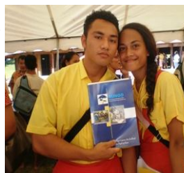
Samoa College students receiving a SUNGO Promotional Package at Open Day.