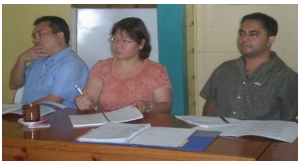
Sui auai i le taimi o le fonotaga.

polokalame. Ua tuuina atu foi tusi valaaulia mo sui eseese mai le atunuu ina ia fausiaina se Komiti Faufautua e vaavaaia ma faufautua le agai I luma o lenei poloketi. Na aloaia se fonotaga I le faaiuina ai o lenei faamoemoe ma le Vaega a le Malo Afaatasi faatasi ai ma sui o le Komiti Faafoe ma le pulega a le Faamalu mo Faalapotopotoga Tumaoti I Samoa.