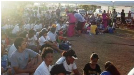
FLO Staff distributing food & drinks to the participants.

event brought together families, members of the community, church groups, NGOs and the general public to walk for a good cause. Refreshments and entertainments were provided by FLO and local artists for the participants after the "Walk for Life" event. Please Contact Faataua Le Ola on their 24/7 Samoa Lifeline on 8005433 for more information and SAVE A LIFE NOW.